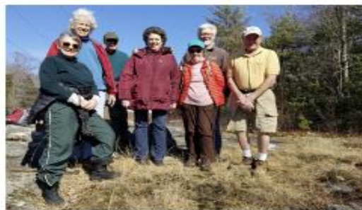
Drummer Hill hike pre-distancing